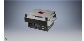
Sahara Fan Model SF315

Width - 1486mm Depth - 680mm Height - 900mm Weight - 110kg