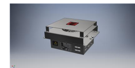
Sahara Fan Model SF309

Width - 1158mm Depth - 680mm Height - 900mm Weight - 75kg