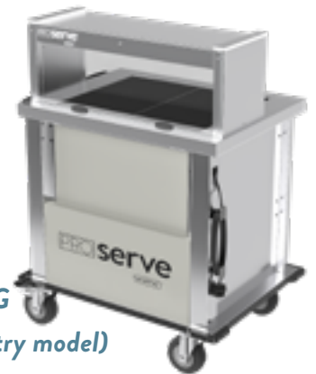
P1GENG (no gantry model)