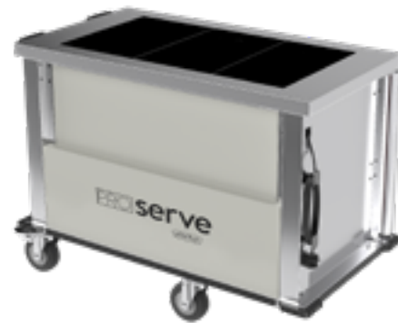
P2GGENG (no gantry model)

This unit is ideal for multi-portion and multi-choice catering, supporting diverse dietary requirements and ensuring proper separation of different food types.