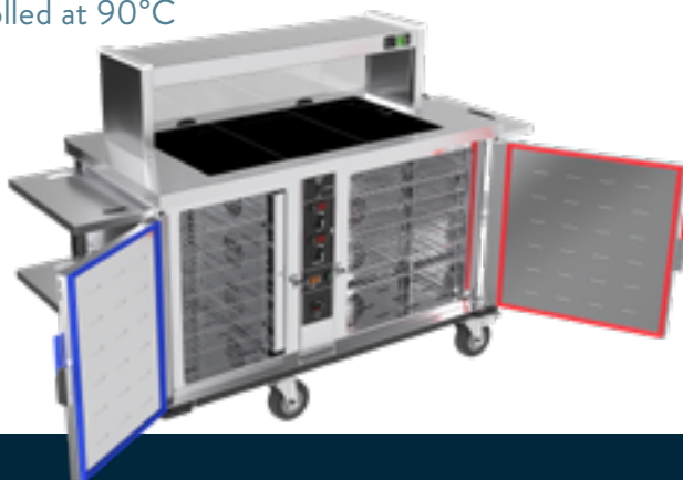
P2GRE (model with heated gantry shown with optional shelving)