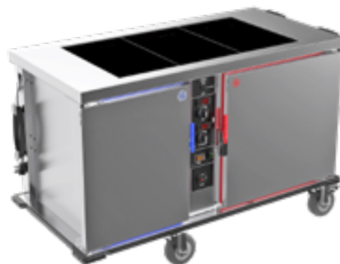
P2GRENG (no gantry model)