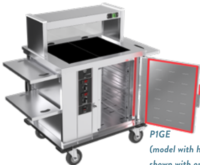
P1GE (model with heated gantry shown with optional shelving)