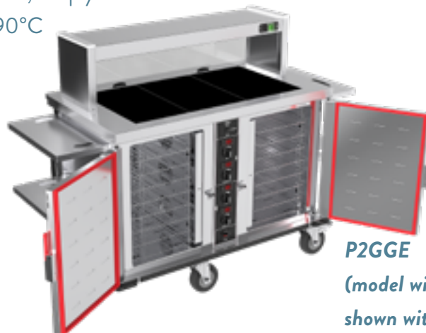
P2GGE (model with heated gantry shown with optional shelving)