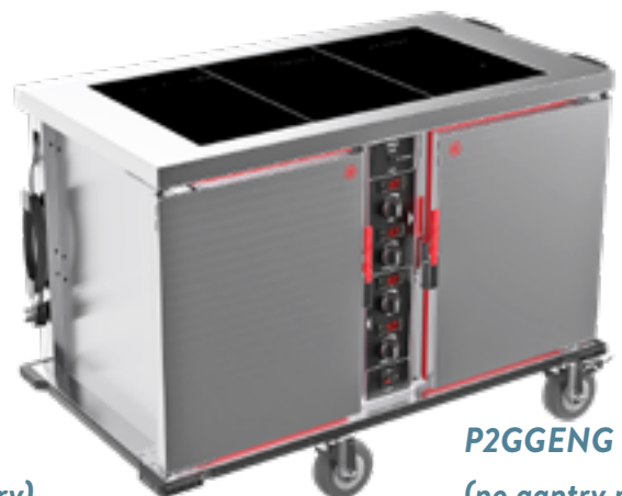
P2GGENG (no gantry model)

With or without a pass over heated and illuminated gantry / shelf.