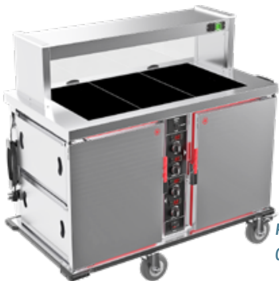
P2GGE (model with heated gantry)