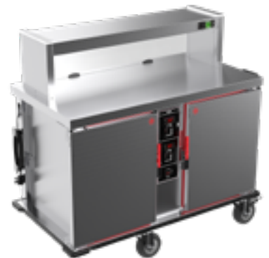
Model P2HHG (with gantry)

P2HH Shown with optional fold down end shelves and front tray slide