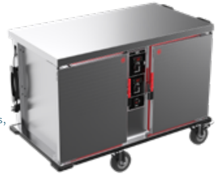
Model P2HH (no gantry)

The P2HHG model has a gantry pass over shelf with full front screen, this is illuminated and heated by quartz type lamps.