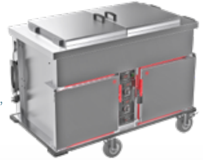
P2HHB (with fold back lids)

The P2HHBG model has a gantry pass over shelf with full front screen, this is illuminated and heated by quartz type lamps.