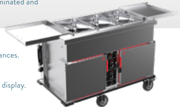
P2HHB (lids folded out ready for service)

P2HHBG Shown with optional fold down end shelves and front tray slide