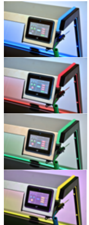
Oven Mode Indication