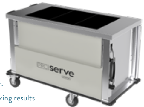
P2GRENG (no gantry) Shown with optional fold down end shelves and front tray slide