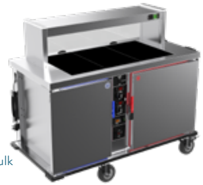
P2GRE (with gantry)

The P2GRE model has a gantry pass over shelf with full front screen, this is illuminated and heated by quartz type lamps.