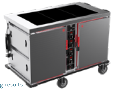
P2GGENG (no gantry)