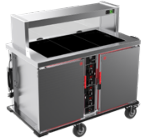
P2GGE (with gantry)

These units allow cook & serve at the point of consumption. Useful for multi-food portioning and multi-food choice. Complete with a self-regulating black glass hot-top. The double oven capacity with unique multi-fan air re-circulation system allows fast and even heat distribution throughout. Optimized for GN (Gastronorm) containers, there are eight shelf position in each oven set at 71 mm intervals . This allows up to eight GN 1/1 containers per oven. This unit ensures hot food is cooked and stays at the ideal serving temperature during service. The ovens have a bright, polished, stainless steel interior, satin finished outer panels, and plastic coated front and sides. Complete with heavy duty hinged doors and slam shut door catches.