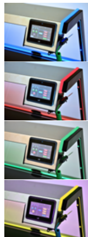
Oven Mode Indication