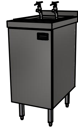
View with a standard sink top with rear up-stand and 70mm rear void