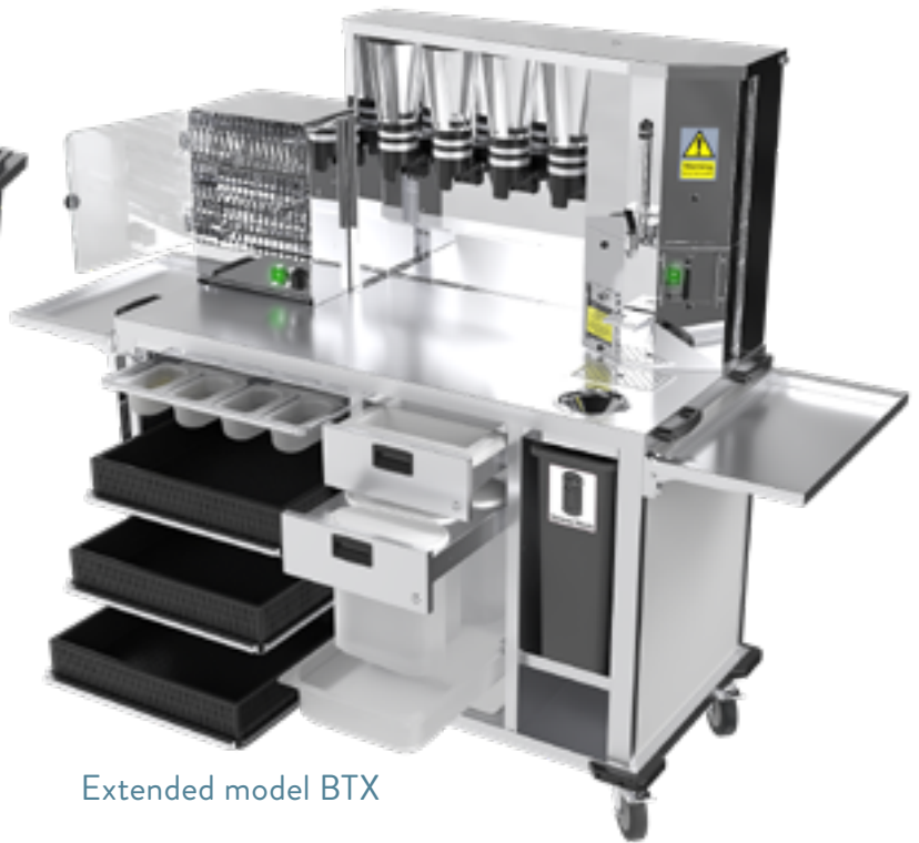
Extended model BTX