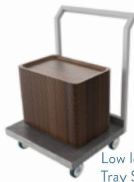
Low load Tray Stacker.