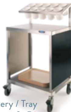
Cutlery / Tray Storage & Dispenser.