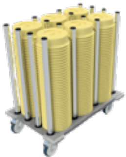
Plate Cover Storage.