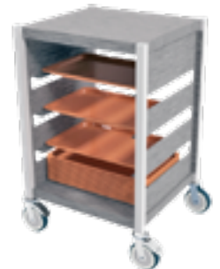
Tray / Basket Station.