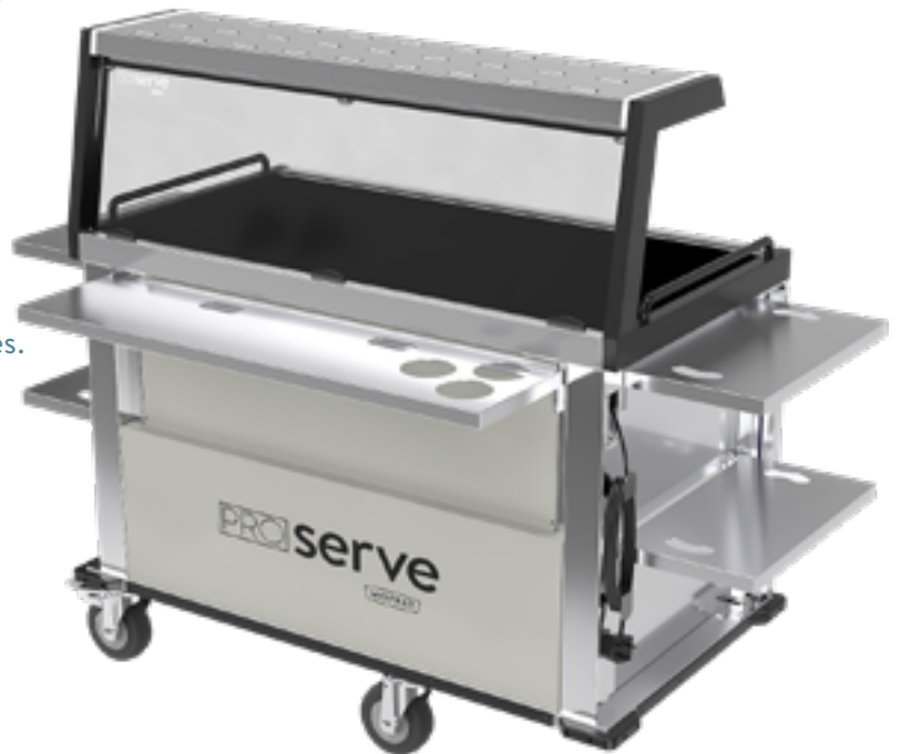
Model:- P2GR Shown with optional fold down tray slide and end shelves.