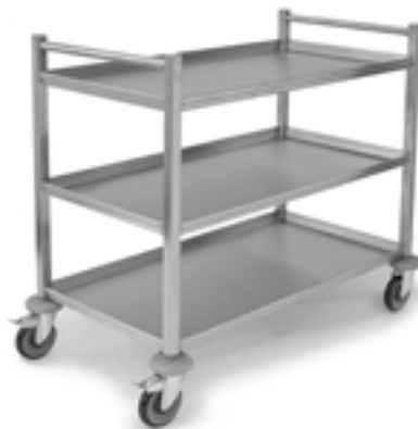
General Purpose Trolley.