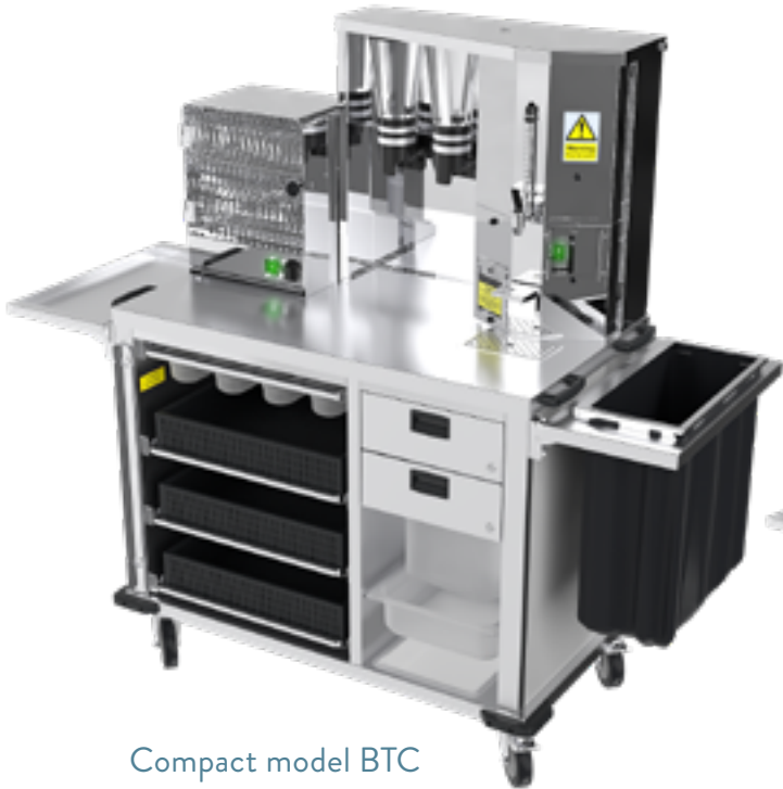
Compact model BTC

Compact, refined, and highly manoeuvrable solutions for tea, coffee, and breakfast service. Ideal for bedside, lounge, and communal service in demanding healthcare environments.