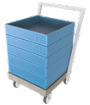
Low Load Basket Stacker.