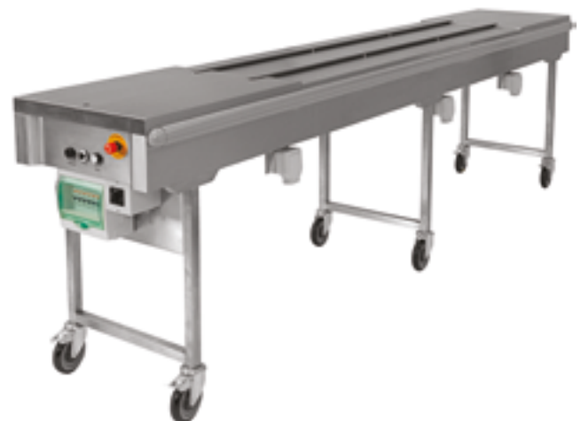
Conveyor Cord Version Parallel 15mm diameter green coloured synthetic round cords Designed for maximum hygiene with minimum cleaning.