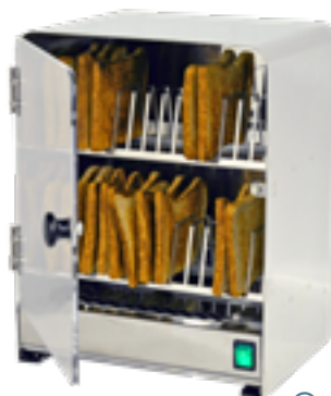
30 slice model:- TW1

Optional Toast Warmer Available in two sizes. 30 slice or 45 slice.