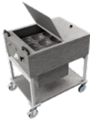
Mobile Bain-Marie & Chilled Wells.