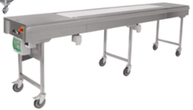
Conveyor Belt Version 300mm wide seamless 'White' synthetic anti-static flat belt, smoothly transports trays or individual items of crockery.