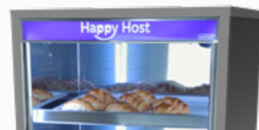
Full width illuminated top signage.

The Ambient display models in the Happy host range have a power sharing interconnection. One hot or cold model can be plugged into an ambient model. This allows the one 13amp power cord from the ambient unit to be used to power up both units.