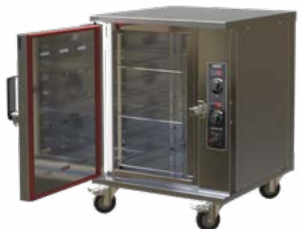
Portrait type oven configuration