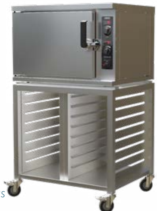
Two CR5L's stacked on support stand CRLHS