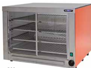
PC2 4 shelves, Doors both sides