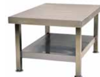
GHD2ST or GHD3ST Floor stand. Allows Table Top heated drawer unit to be used at a height of 900mm