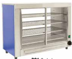
PC1 3 shelves