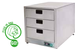
GHD3 Includes 9 off 1/3 Pans