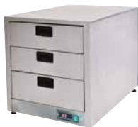
GHD3 Includes 9 off 1/3 Pans

Note: Includes metal GN pan type drawer runners