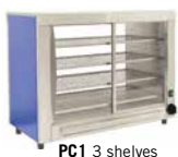
PC1 3 shelves