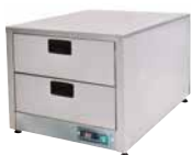
GHD2 Includes 4 off 1/2Pans