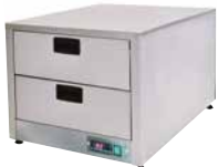
GHD2 Includes 4 off 1/2Pans