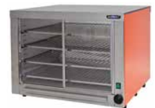
PC2 4 shelves, Doors both sides