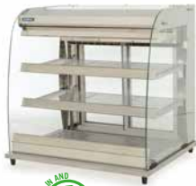
Table Top Heated Display (double glazed sliding doors)