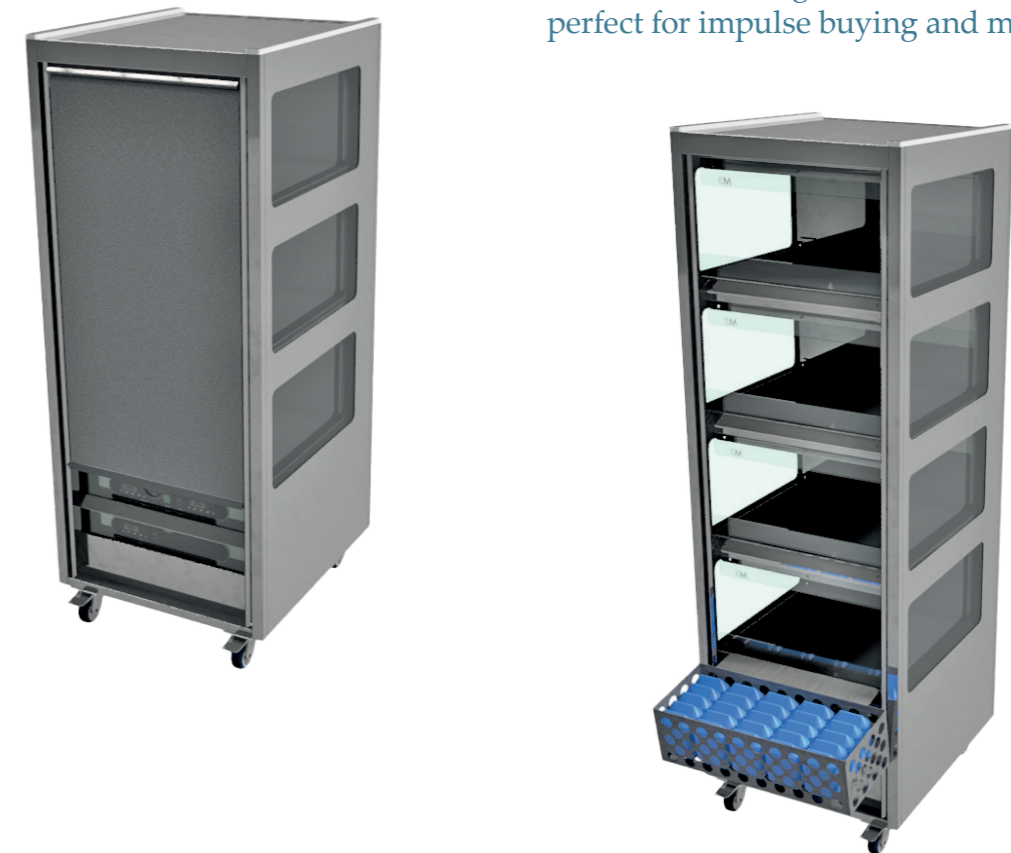
9 Impulse Basket Model GO14 shown with hook-on heavy-duty basket maximising sales and the display space, perfect for impulse buying and meal deal offers.